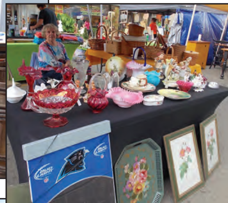
Scenes from last year's Fair...