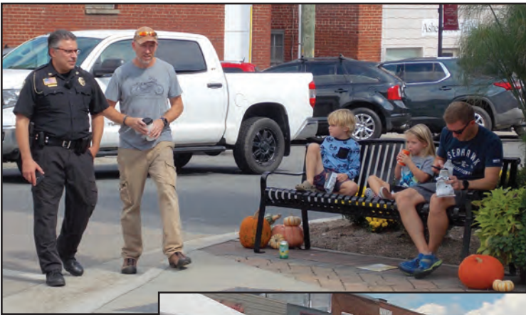
and more from last year...