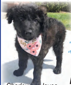
Charley loves our fur baby line!

What people are saying— "Wonderful staff. Great cookies. Unique merchandise" "Wonderful place to shop, Great staff and great prices!"